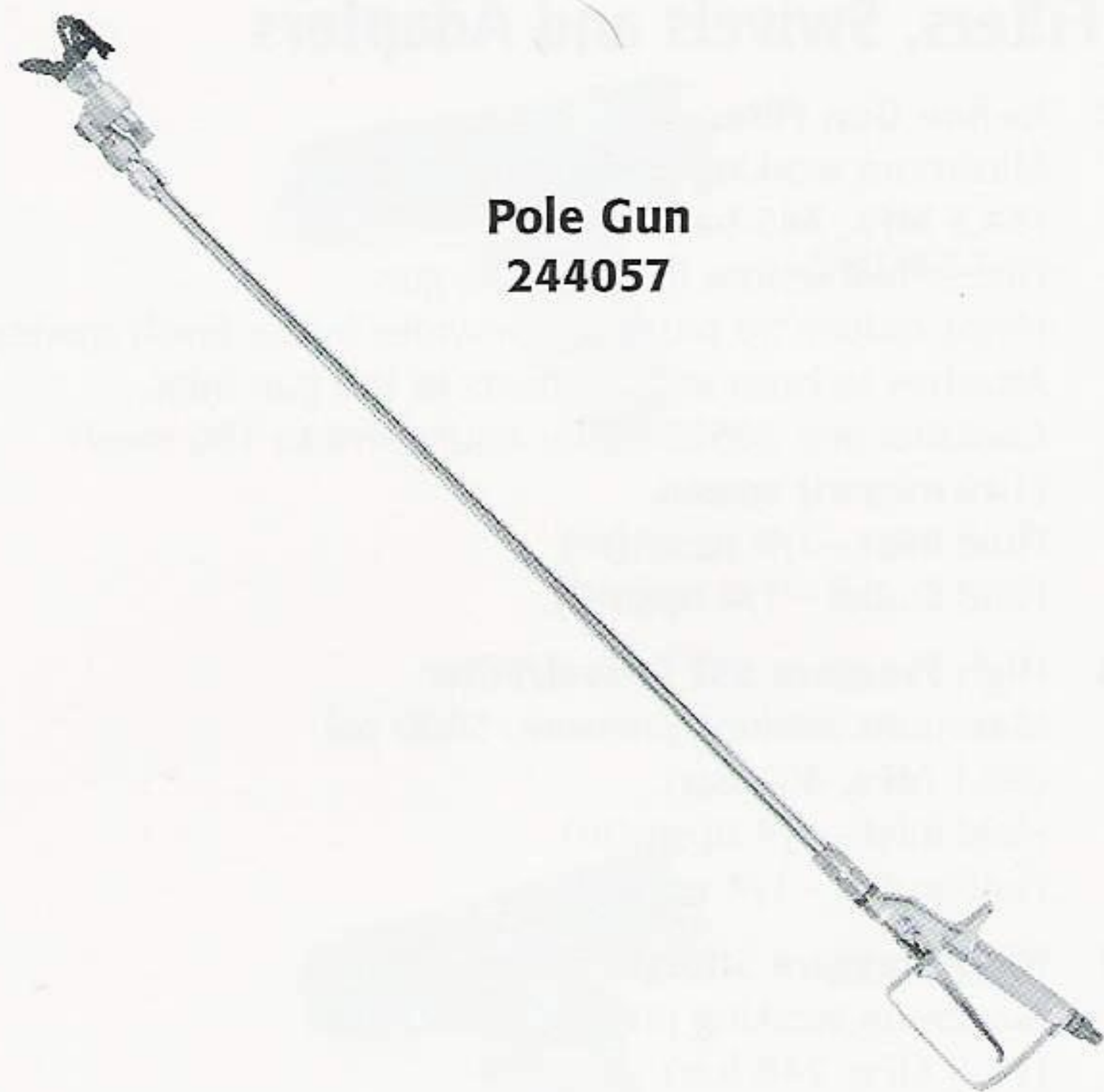
Pole Gun 244057

Maximum working pressure: 3600 psi (24.8 MPa, 248 bar) Use with the Contractor In-Line Valve and the CleanShot Shut-Off Valve to create different length Pole Guns. Lightweight aluminum construction. Unique fitting and captive gasket allow quick attachment to Airless Gun or In-Line Valve. Can be used alone or connected in series for longer reach. Outside Diameter: 5/8 in (15.9 mm). Standard with 7/8 in (22 mm) gun nut. Fits Graco or Titan Guns.