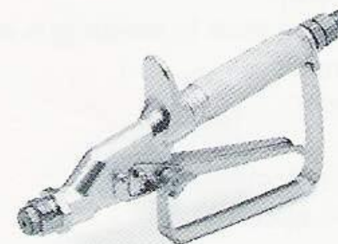
In-Line Valve 244161