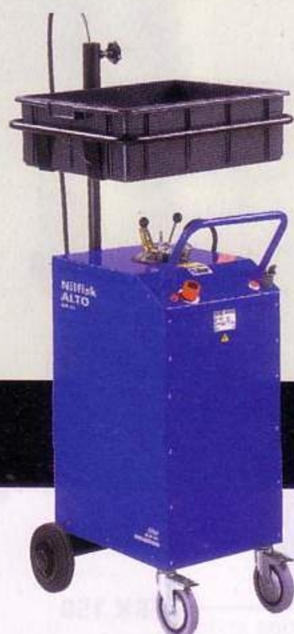
▲ BW 24/35