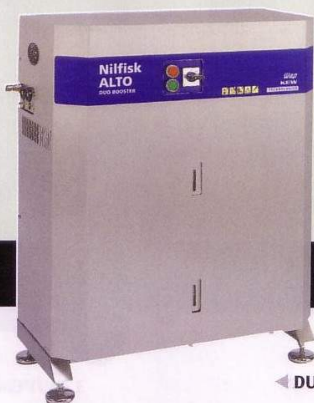
◀ DUO BOOSTER