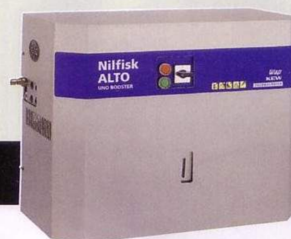
▲ UNO BOOSTER

Nilfisk-ALTO DUO/UNO BOOSTER: Stationary 1 and 2 pump cold water pressure washer for mid- and heavy-duty use in food industry, heavy industry and agriculture. Basic units or extended versions with possibility of customisation, using factory-mounted options.